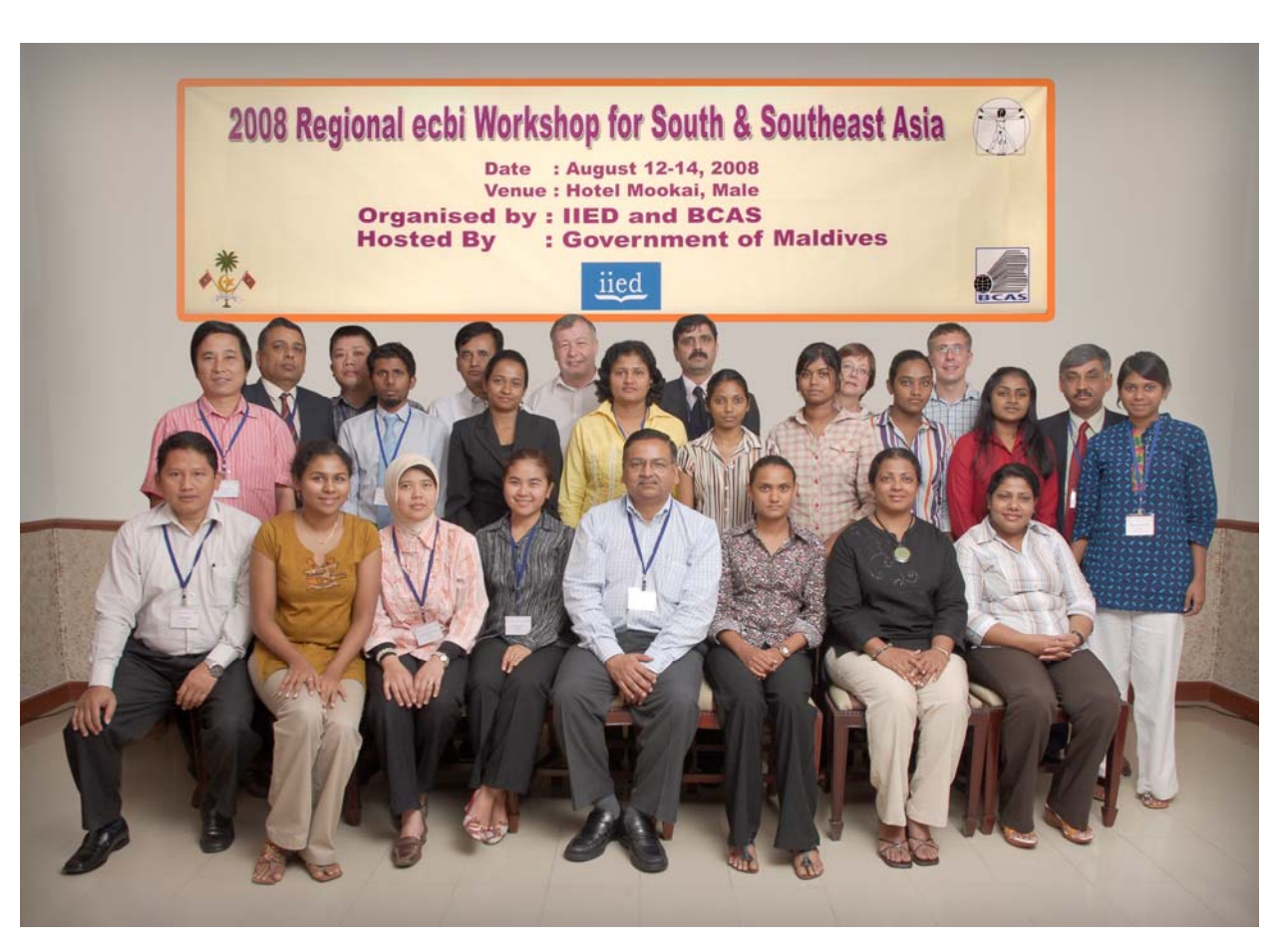
The ecbi Regional Workshop for South and South East Asia in Male was attended by participants from Bangladesh, Indonesia, Maldives, Nepal, Pakistan, Sri Lanka and Vietnam