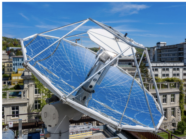
ETH Mini Solar Syngas Refinery

The trouble with SAFs is they are not without their own problems, particularly bio-fuels (see, for example, “The Biofuel Controversy” ), which until recently was the only SAF type I knew of. On 7 December, I received a bulletin from SWI swissinfo.org , the news and information service of the Swiss Broadcasting Corporation, introducing me to How sustainable fuels created from thin air could solve the energy crisis :