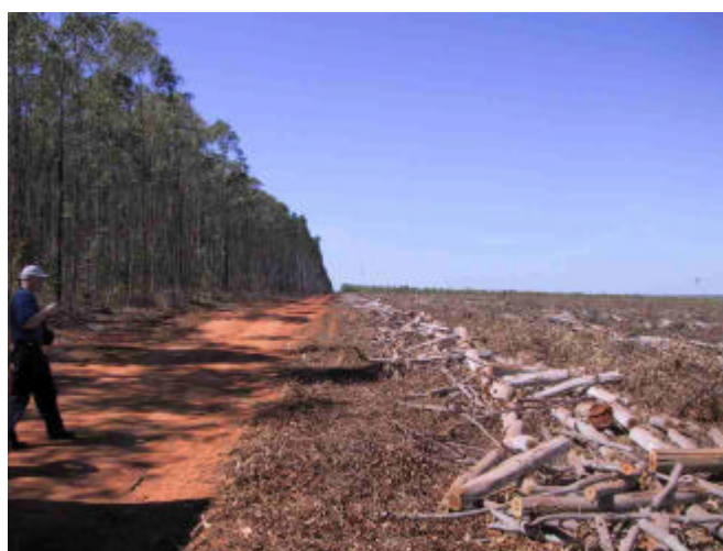
Figure 2: Eucalyptus plantations for charcoal production