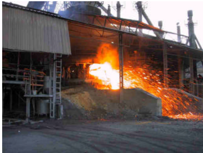
Figure 1: Pig iron mill in Minas Gerais, Brasil.